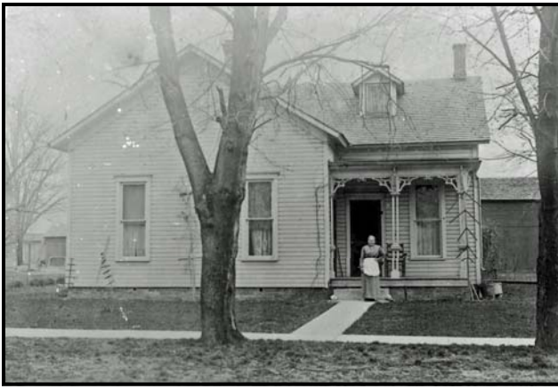
Emma Knight at the Knight home, 102 East Allison Street, Stryker, prior to extensive alterations.