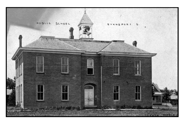
This school was constructed in Evansport circa 1890. Classes were discontinued in the late 1940s, and the building was razed in 2004.

circa 1920. The structure was used for classes until the late 1940s and was razed in 2004. The site is now occupied by the Tiffin Township Fire Station.