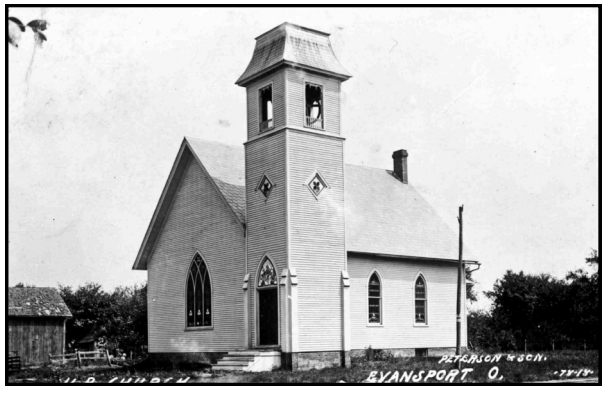
The "Radical" Evansport United Brethren congregation built this church in 1898 at the corner of West and Fifth streets. It was dismantled in the 1930s.

gregation built a wooden frame church with a square bell tower and stained glass windows at the southeast corner of West and Fifth streets. In 1938, the property was sold. The church was dismantled and the material was used to build an addition to the Defiance Pilgrim Holiness Church.